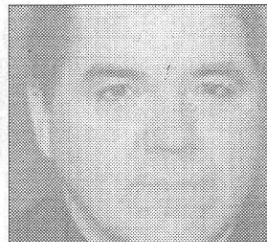
RAINY RIVER DISTRICT NOTES