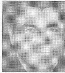
RAINY RIVER DISTRICT NOTES