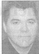
RAINY RIVER DISTRICT NOTES

Fast forward to a Fort Frances with a population of about 8,000. The sale was held, money was collected